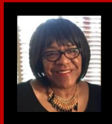
Joslyn White Paradise Baptist Church