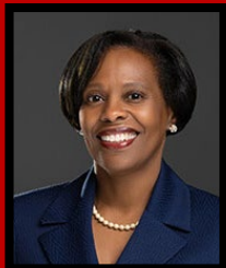
Joslyn White Paradise Baptist Church