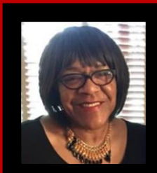
Joslyn White Paradise Baptist Church